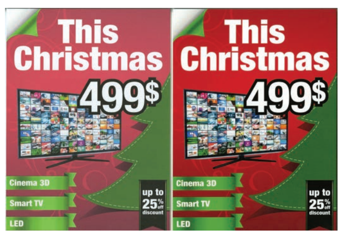
Photo of FOME-COR SIRIUS (right) and an alternative, uncoated foam board (left) printed on the PageWide XL Pro