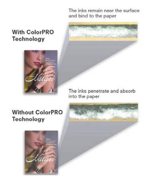
ColorPRO Technology is incorporated into the paper-making process, delivering visibly enhanced print quality when used with HP pigment inks

Much of this performance advantage can be traced to the proprietary technology used to optimize the paper facers. The papers have been qualified by HP and proven successful in multiple applications, and FOME-COR SIRIUS and DISPA SIRIUS display boards with ColorPRO Technology are recommended by HP for optimum performance and value when working with the PageWide XL Pro printer series.